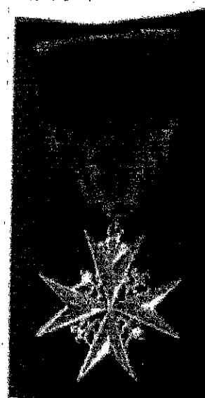
The insignia of a Serving Brother of the Most Venerable Order of the Hospital of Saint John of Jerusalem